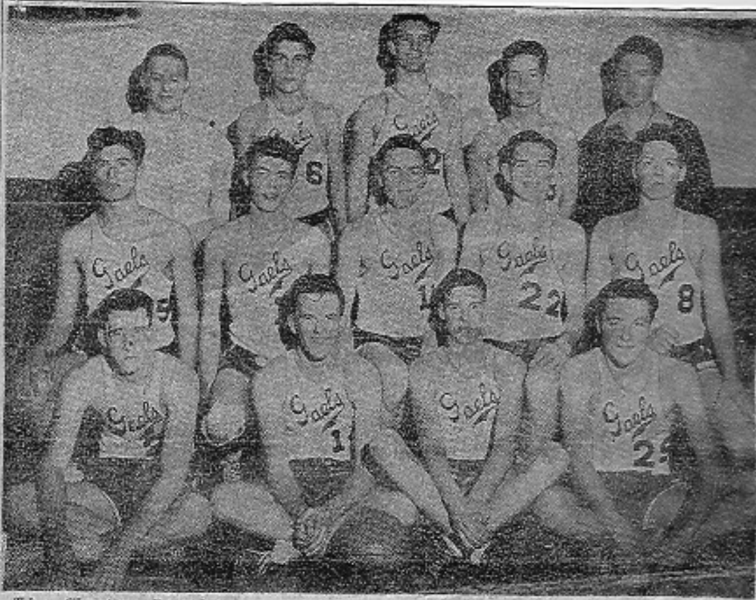
The Christian Brothers School basketball team, which has lost but one game this season, is pictured here. The Brothers downed Nevada City last night.