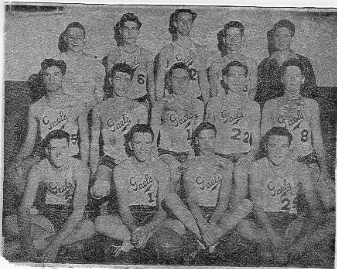
1947 BASKETBALL TEAM