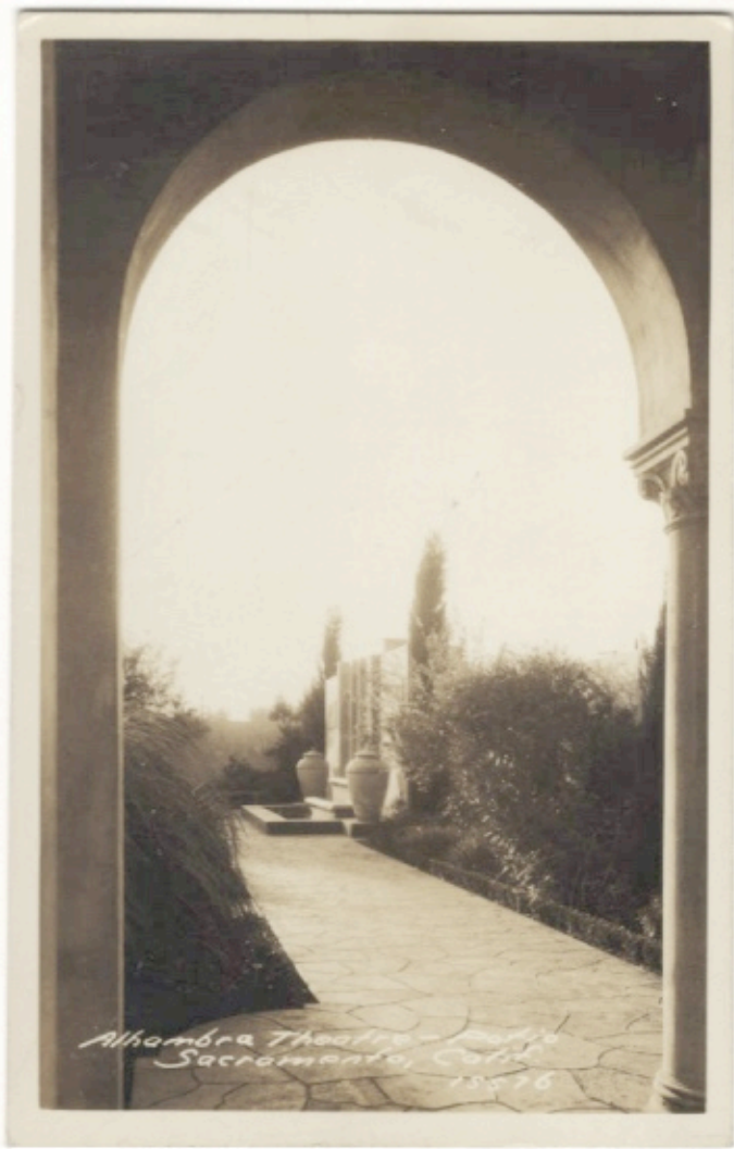
Alhambra Theatre - Patio Sacramento, Calif. 1916