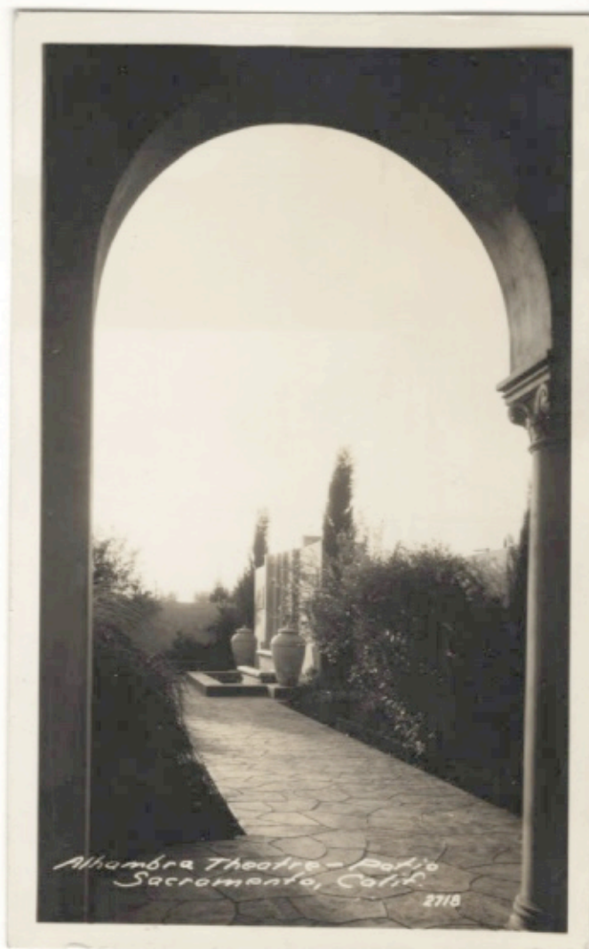
Alhambra Theatre - Patio Sacramento, Calif.