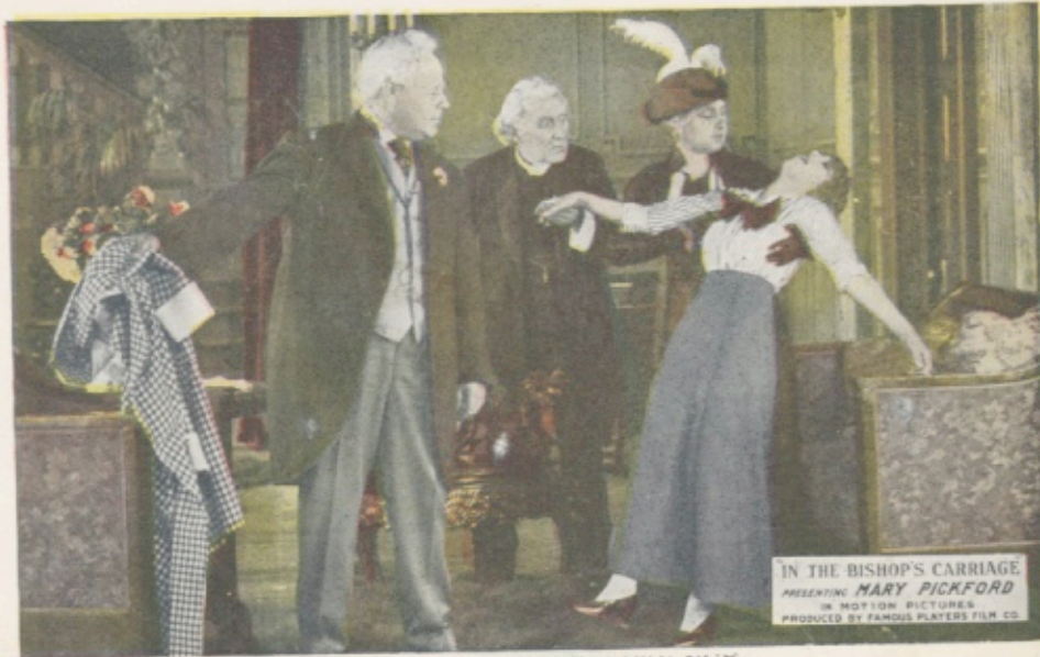
IN THE BISHOP'S CARRIAGE PRESENTING MARY PICKFORD IN MOTION PICTURES PRODUCED BY FAMOUS PLAYERS FILM CO.