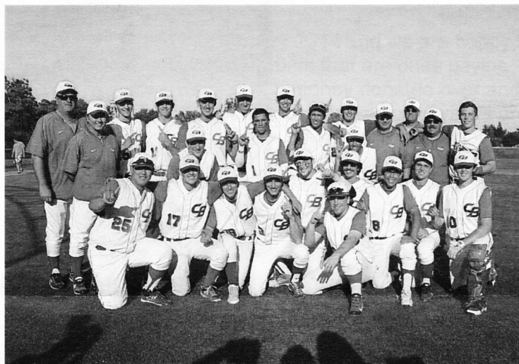
The 2014 CB Varsity Baseball Team, CVC Champions