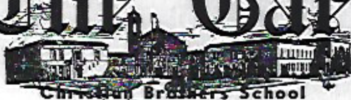
Christian Brothers School

SACRAMENTO, CALIFORNIA, FRIDAY, MAY 14, 1954