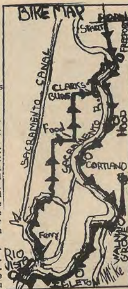
Bike Map—Ride to