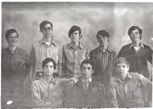
The Christian Brother debate team. See if you can identify the members. You won't win any prize, but what the heck.