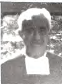
See if you can identify this mystery person. Hint: See article above picture.