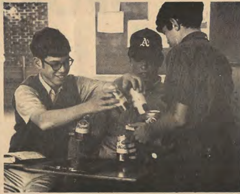
3 Young actor's in the Drama Club.

Everybody, that is, EVERYBODY, is welcome to pitch in and help the Pep Club. If you have nothing to do some day after school, paint a sign or give some bright ideas to your Pep Club on how you think they can express the spirit inside the Student Body.