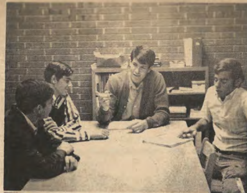
Members of the Student Advisory Board.