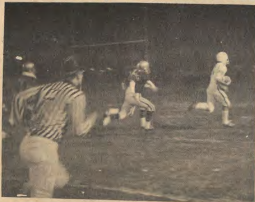
A falcon runs around right end for a touchdown during the Elk Grove game, which Christian Brothers won 28-6.