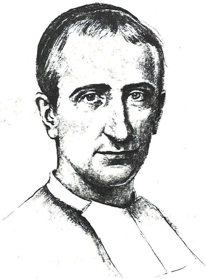
Saint Miguel Febres Cordero

He was born in Cuenca, Ecuador, on November 7th 1854. He distinguished himself by his zeal in the apostolate of education as well as by religious qualities and intellectual gifts. His reputation as a writer, philologist and poet led to his being elected to the Ecuadorian Academy in Quito. He was loved by all who knew him for his simplicity and affability. He died in Premia del Mar, Spain, on February 9th 1910. He was beatified by Paul VI on October 30th 1977, and canonised by John Paul II on October 21st 1984. He is buried in Quito where a constant stream of pilgrim visits his tom. In the Institute, his feast is Kept on February 9th.