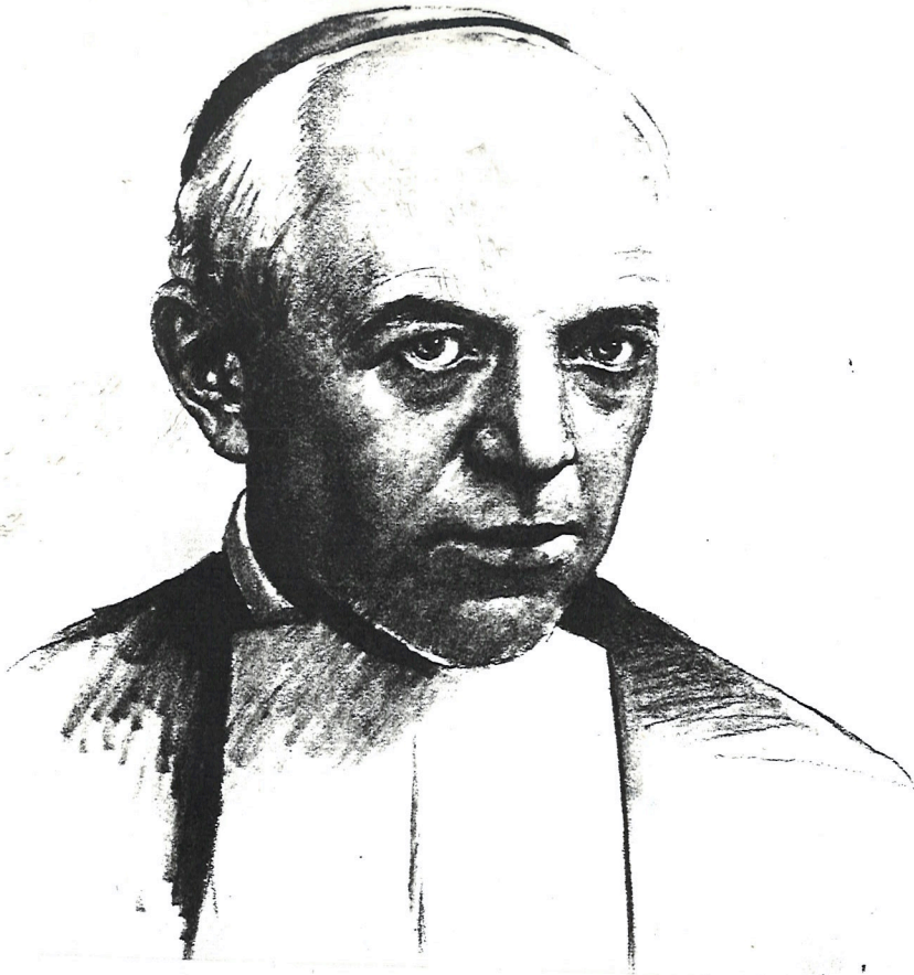
Saint Mutien Mary (Louis Joseph Wiaux)

He was born in Mellet, Belgium, on March 20th 1841. He was a model Christian Teacher in Malonne where he spent the greater part of his life. He was outstanding among his Brothers for his great humility, his observance of the Rule, and his obedience to his Superiors.