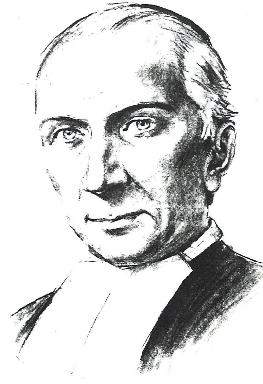
Blessed Scubilion (Jean Bernard Rousseau), missionary

He died at Malonne on January 30th 1917 after distinguished by Christian virtues. He was beatified by Paul VI on October 30th 1977, and canonised by John Paul II on December 10th 1989. His tomb is a centre of pilgrimage. His feast is celebrated in the Institute on January 30th.