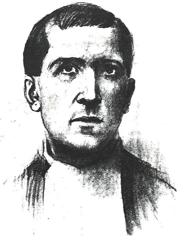
Blessed Jaime Hilario, martyr

Manuel Barbal Cosan was born in Enviny, Spain, on January 2nd 1898. As a religious he showed great piety and a burning zeal for teaching young people. He had a great devotion to the Blessed Sacrament and to Our Lady, and was a model of religious virtues. When civil war broke out in July 1936, he offered no resistance to the soldiers who came to arrest him, and he invited his companions to sing the Te Deum because the Lord had granted him the grace to suffer something for him. Condemned to death, he received the martyr's palm on January 18th 1937.