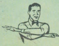
Incomplete forward pass. No penalty.