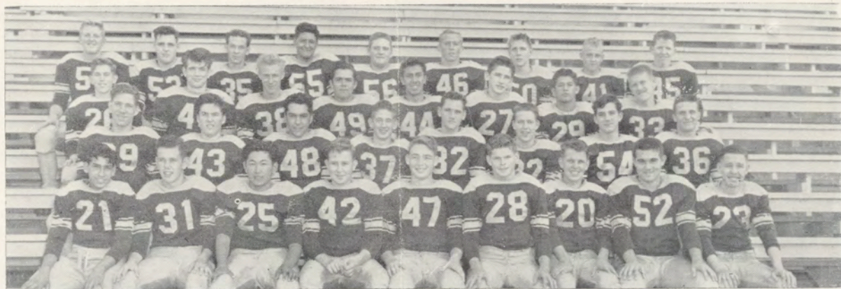
Y. C. U. H. S. Varsity Squad . . . The Honkers