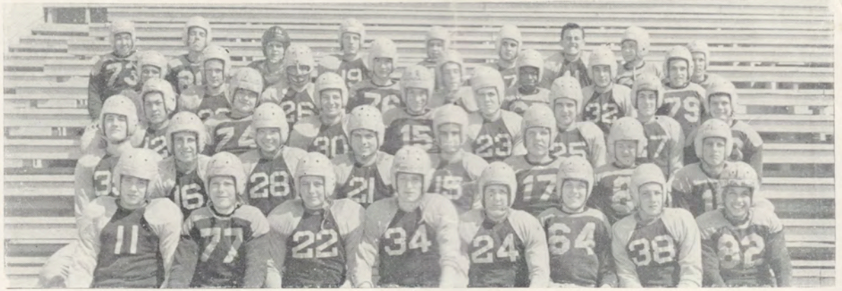
Y. C. U. H. S. Junior Varsity . . . The Honklets