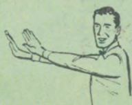
Defensive Holding. 5 yards.