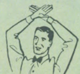
Time out. Have a Pepsi.