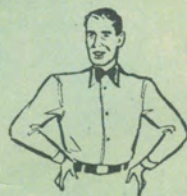
Offside. 5 yards.