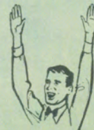
A score. Have a Pepsi.