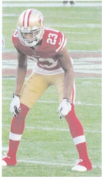
Witherspoon in 2017