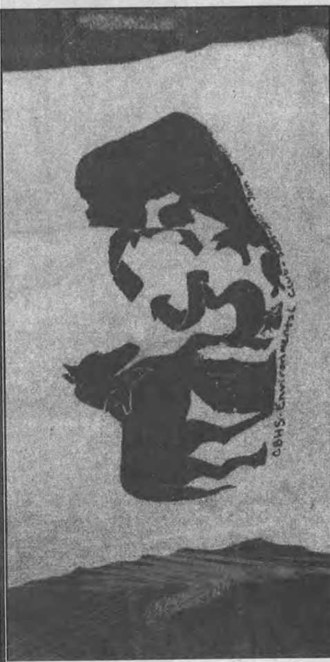
Pictured above is this year's eco-friendly lunch bag, advertised by CB's Environmental Club. The bag looks to portray the connectedness of Earth's animals and our efforts to recycle and do our part.

CB's Student-Run, Student-Generated Publication Volume 134, Issue 6 Spring 2010