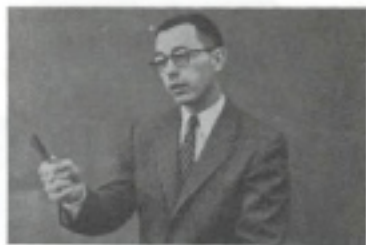
Now Look Here You!