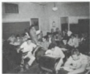
Period of Concentration