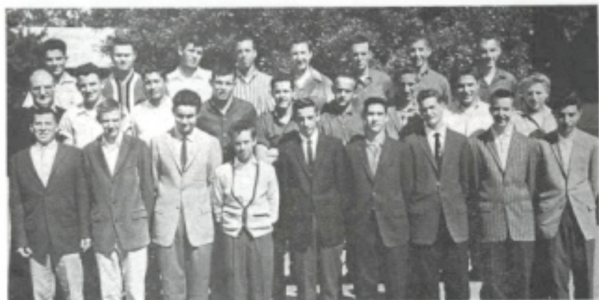
HOME ROOM 209