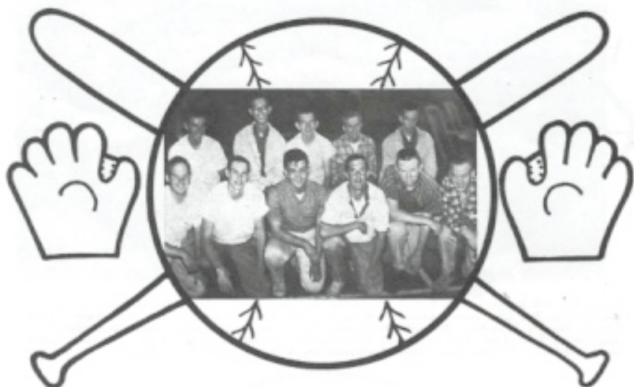
Top Row—Left to Right: