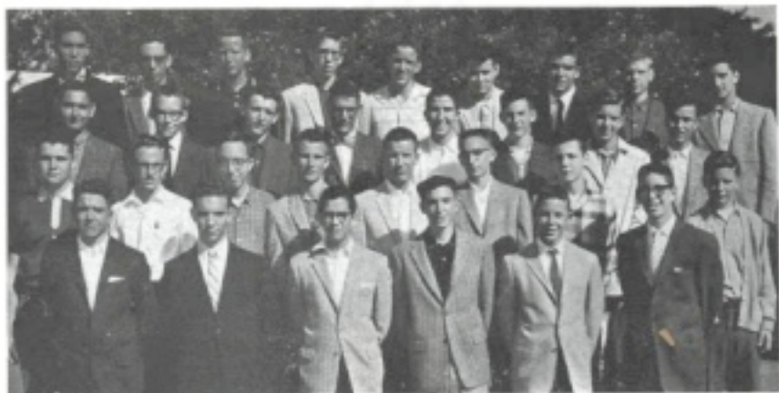
HOME ROOM TC3