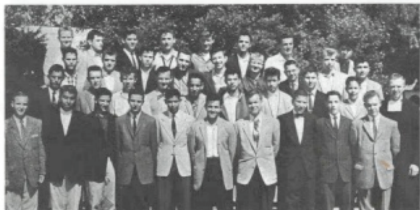
HOME ROOM 223