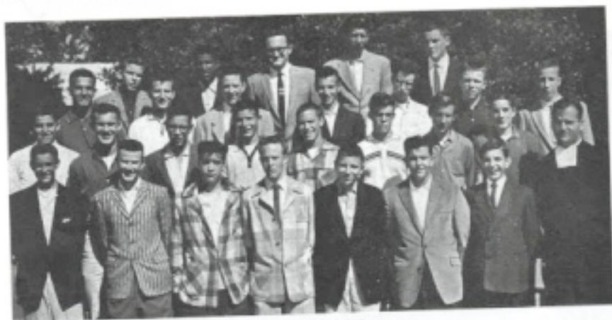
HOME ROOM 219