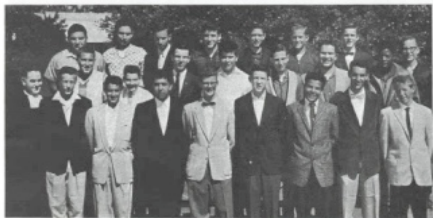
HOME ROOM TC2