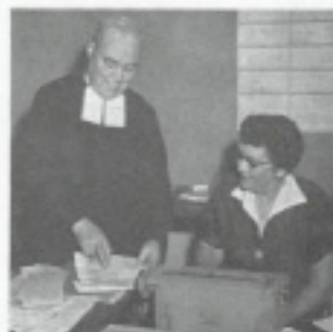
In the Office