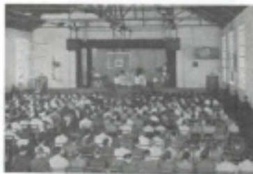
First Friday Mass