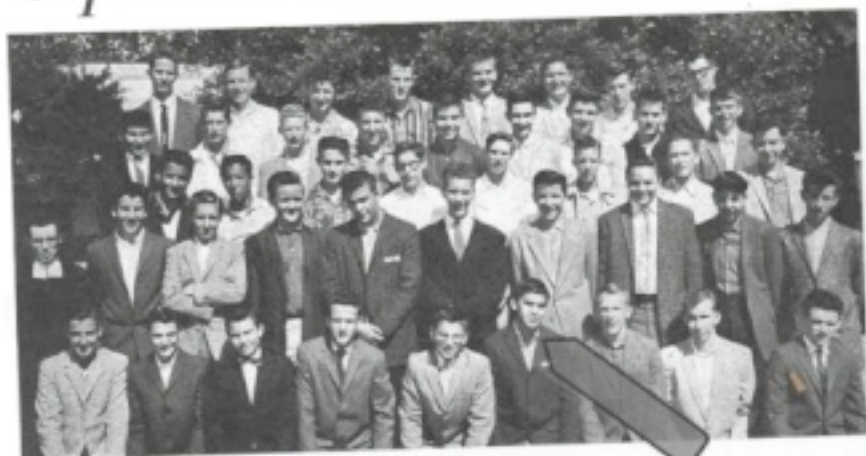
HOME ROOM 213