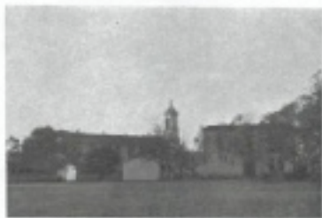
Our Back Yard