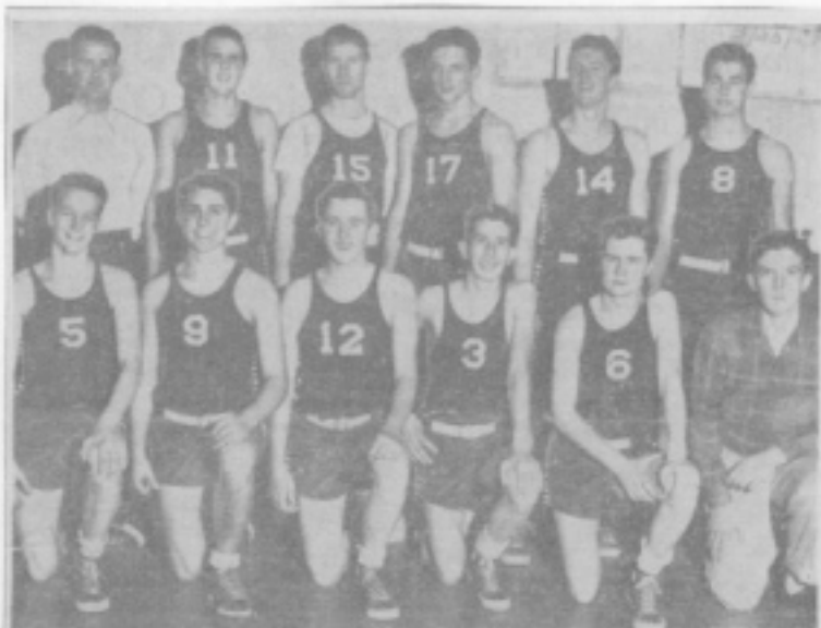
GAELE CAGERS —The Christian Brothers School Gaels will meet the C. K. McClatchy High School Lions tonight in the junior college gym and will end their basketball campaign Saturday against the Sacramento Junior College's reserve quintet. The squad con-