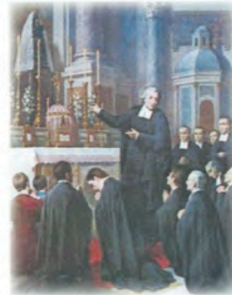
In 1694, De La Salle and 12 of his companions consecrated themselves to God for life, making vows of association for the education of the poor, stability, and obedience.

John Baptist de La Salle was born on April 30, 1651 in Reims, France, during the reign of Louis XIV. The eldest of 11 children, De La Salle was raised in the midst of privilege and modest wealth, and made known his intention to enter the priesthood at the age of 11. At 16, De La Salle was named Canon of the Reims Cathedral, a position of great honor and financial benefit, and one that placed him on a course for high ecclesiastical power.