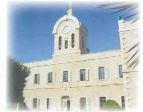
De La Salle Hall at Bethlehem University was built in 1893 to house the Christian Brothers elementary school known as Freres School. In 1973 Freres School moved to a different location and Bethlehem University was founded by three Brothers from the U.S.

Established in 1973 as the first Catholic university in the Holy Land, Bethlehem University plays a significant role in serving the educational and professional development needs of the Palestinian community, and in fostering inter-religious dialogue. Jointly founded by the Vatican and the De La Salle Christian Brothers, Bethlehem University opened its doors in 1973 with an enrollment of 112 students. Now, with more than 13,000 graduates since its founding, Bethlehem University annually enrolls more than 3,000 students in bachelor, master and professional diploma programs.