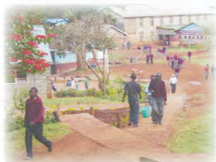
St. Mary's Secondary School in Nyeri, Kenya, opened on October 1, 1959. In 1990, the Brothers were asked by the Archbishop of Nyeri to take over administration of the school.

T winning is an initiative from the center of the Institute of the Brothers of the Christian Schools that encourages financially able Districts to aid those most in need. In response to the General Chapter's call for Twinning, the District Visitors of the former United States and Toronto Region launched a Twinning Program in 1995 to financially assist the Lwanga