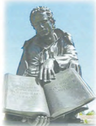
Statue of St. John Baptist de La Salle, patron of teachers, at St. Mary's College of California.

T he Office of Lasallian Education conducts formation programs designed to deepen and strengthen the commitment of participants to the Lasallian mission and enhance their educational and leadership skills.