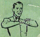
Interference with forward pass. First down at point of interference.

ENJOY PEPSI-COLA, THE ONLY COLA THAT'S C