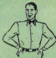
Offside. 5 yards.