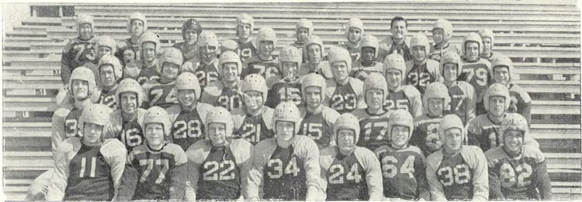
Y. C. U. H. S. Junior Varsity . . . The Honklets