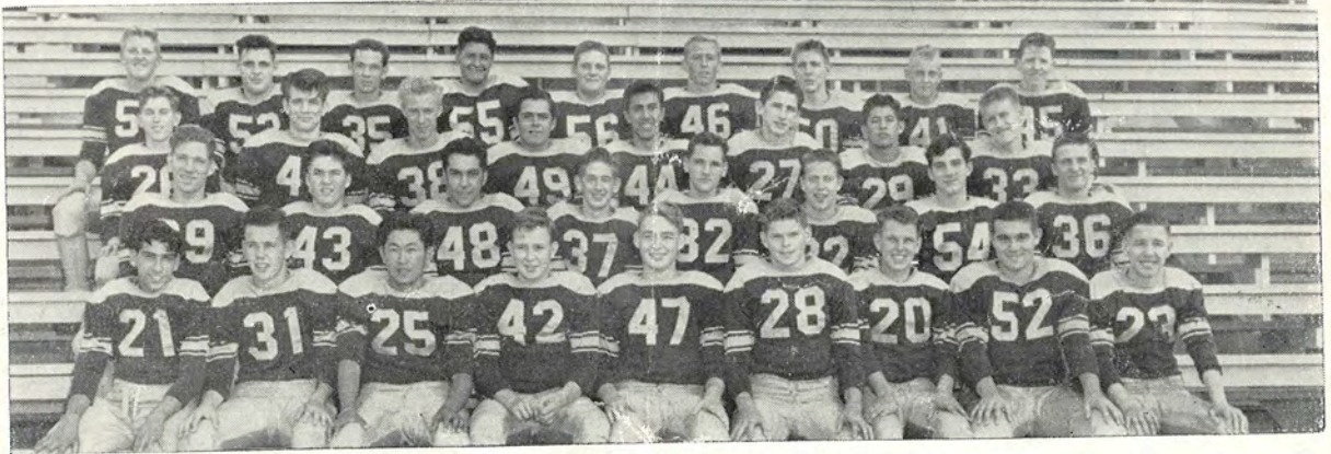
Y. C. U. H. S. Varsity Squad . . . The Honkers