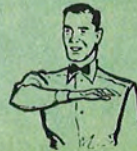
Illegal motion or shift. 5 yards.