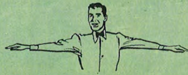
Unsportsmanlike conduct. 15 yards.