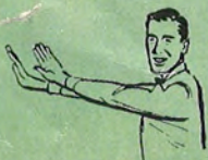
Defensive Holding. 5 yards.