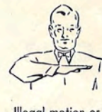
Illegal motion or formation at snap