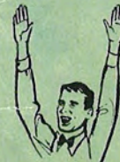
A score. Have a Pepsi.