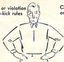
Crawling, pushing or helping runner