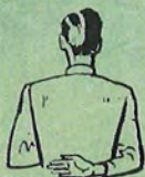
Illegal forward pass. Loss of down and 5 yards.