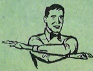
Incomplete forward pass. No penalty.