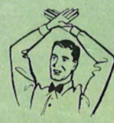
Time out. Have a Pepsi.