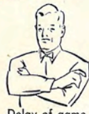
Delay of game or excess time out