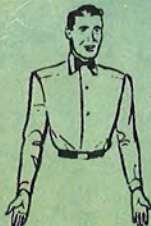
Crawling; or assisting runner. 5 yards.