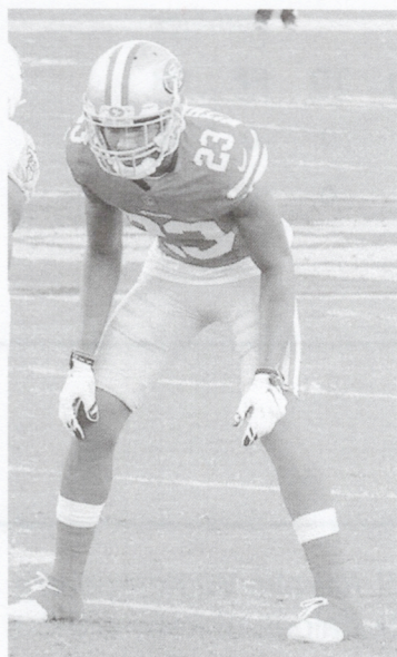
Witherspoon in 2017

the matchup against the Eagles and credited him with allowing three receptions on eight targets. [16] During a Week 16 matchup against the Jacksonville Jaguars, Witherspoon recorded his second interception of the year by picking off Blake Bortles as the 49ers won by a score of 44-33. [17]