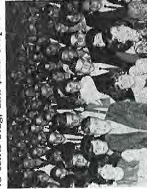
Scene at Homecoming Dance

Admission to the dance will be 75 cents stag, and $1.25 couple.