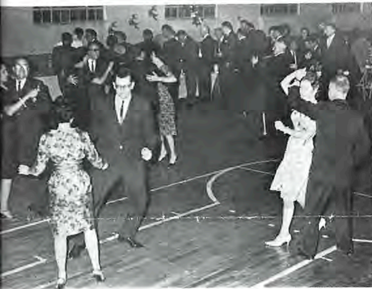
Twisting at December 1st Mother's Club Dance.