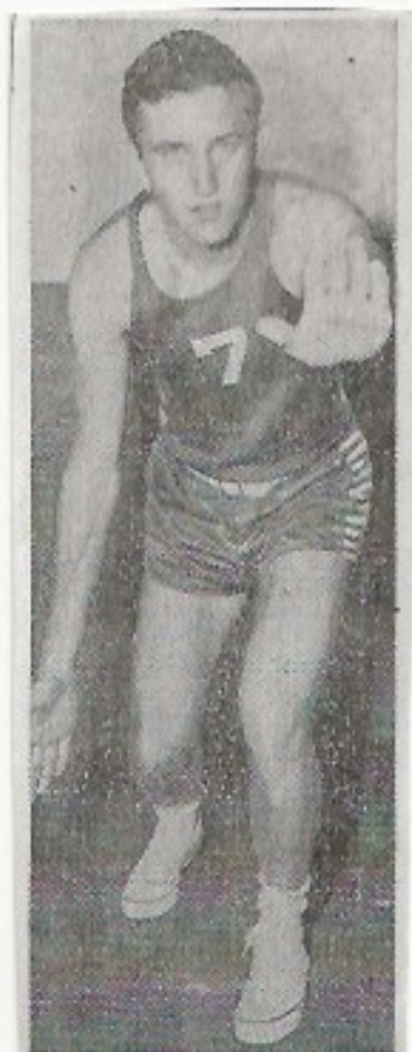
Jerry Kirrene Bee Photo