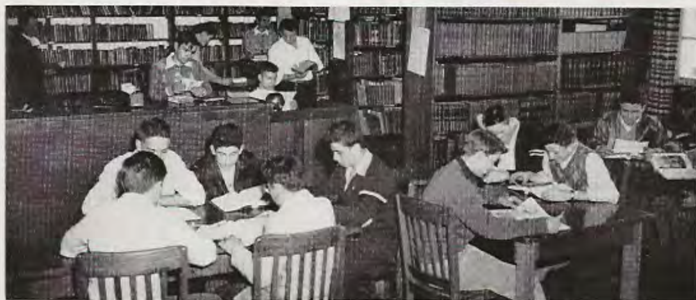
STUDENTS STUDYING IN SCHOOL LIBRARY