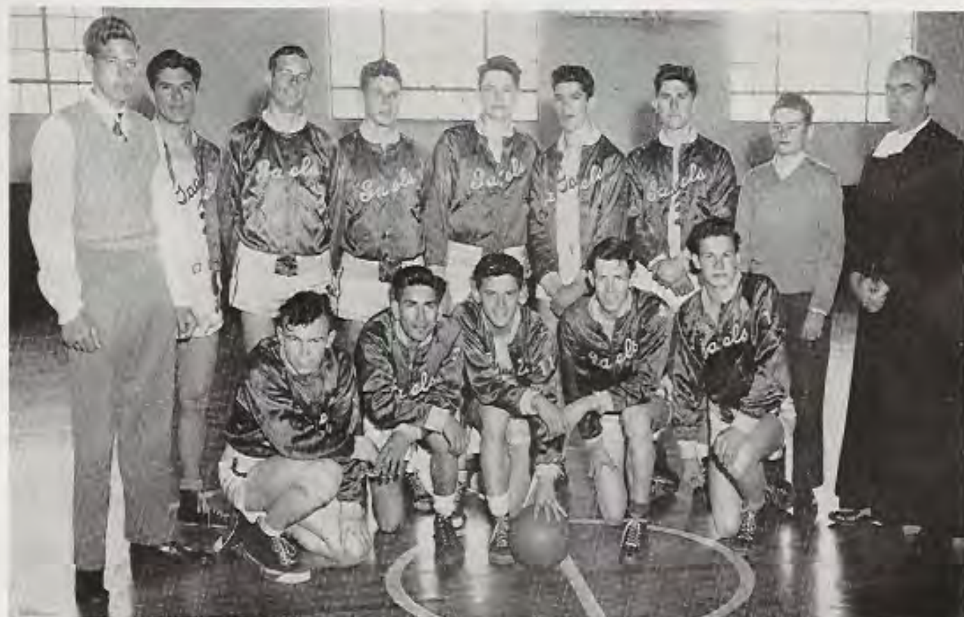
CHRISTIAN BROTHERS BASKETBALL VARSITY