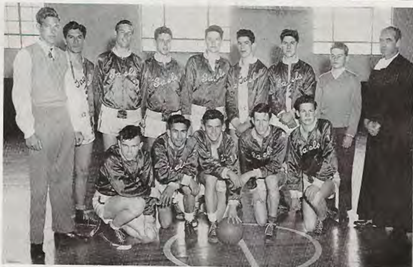
CHRISTIAN BROTHERS BASKETBALL VARSITY