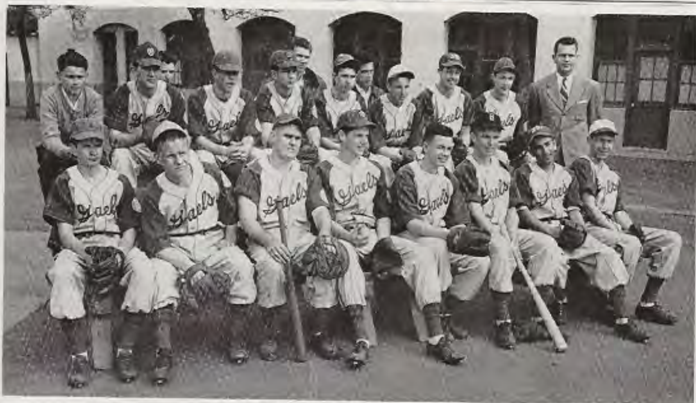
CHRISTIAN BROTHERS BASEBALL VARSITY