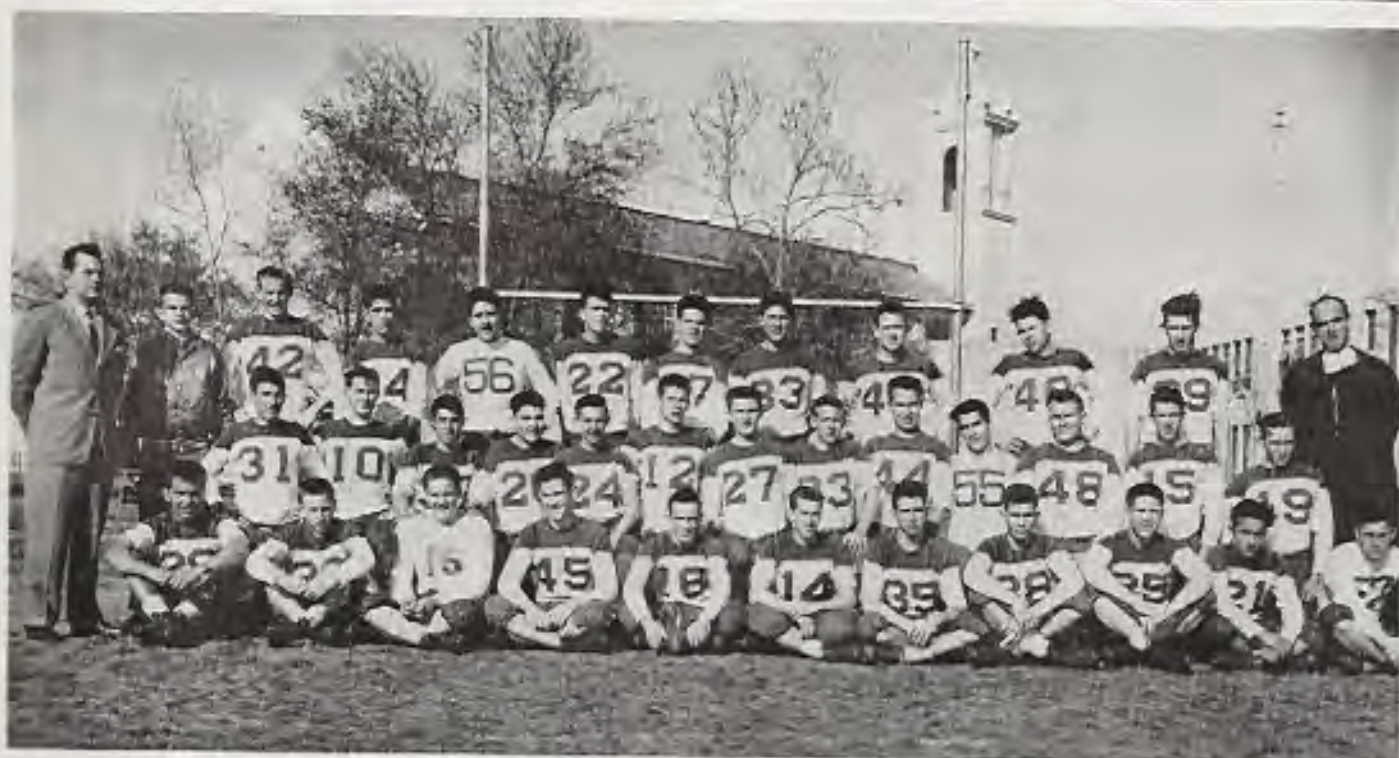
CHRISTIAN BROTHERS 1947 FOOTBALL VARSITY