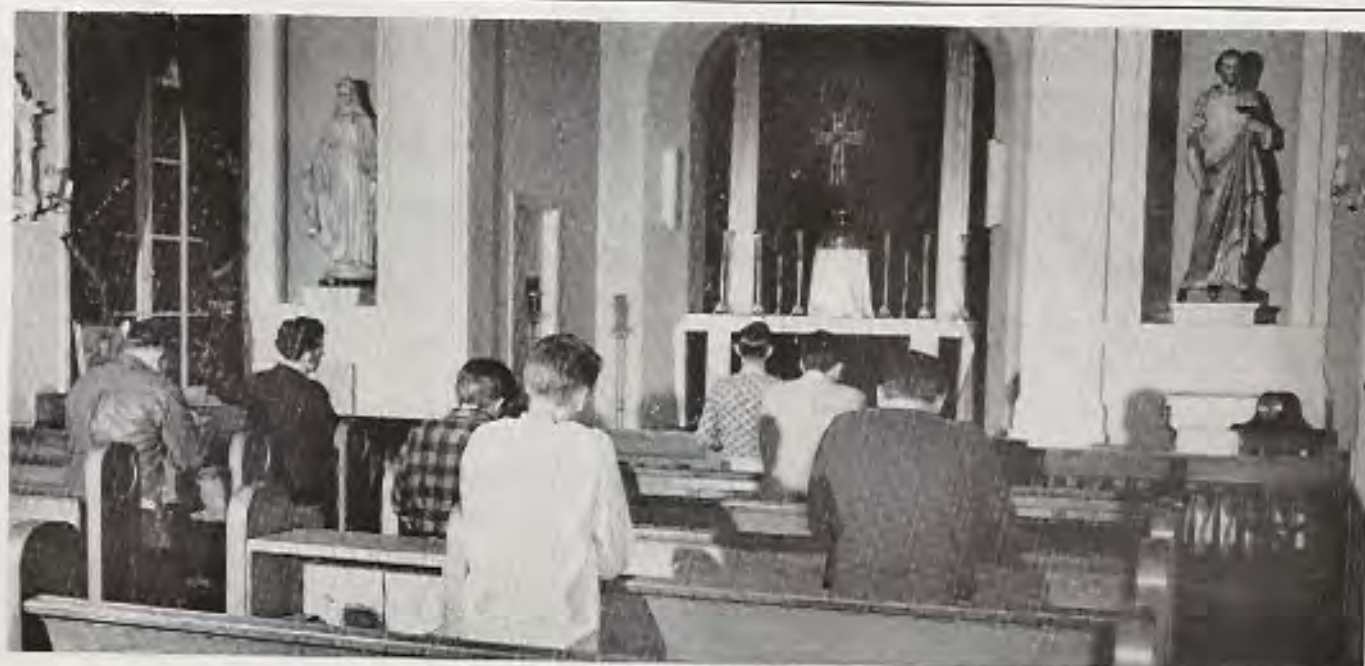
MEDITATION IN THE SCHOOL CHAPEL