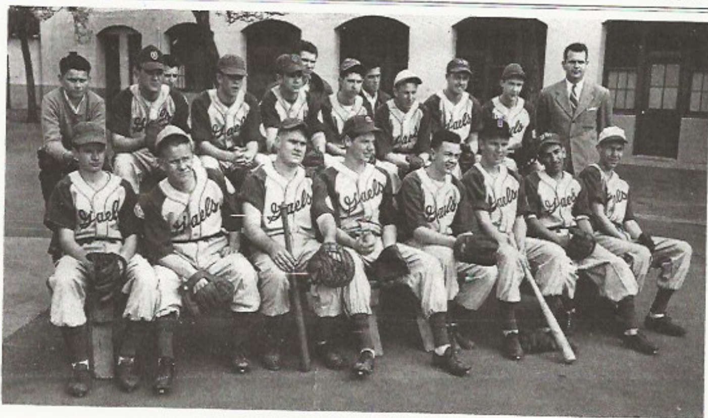
CHRISTIAN BROTHERS BASEBALL VARSITY