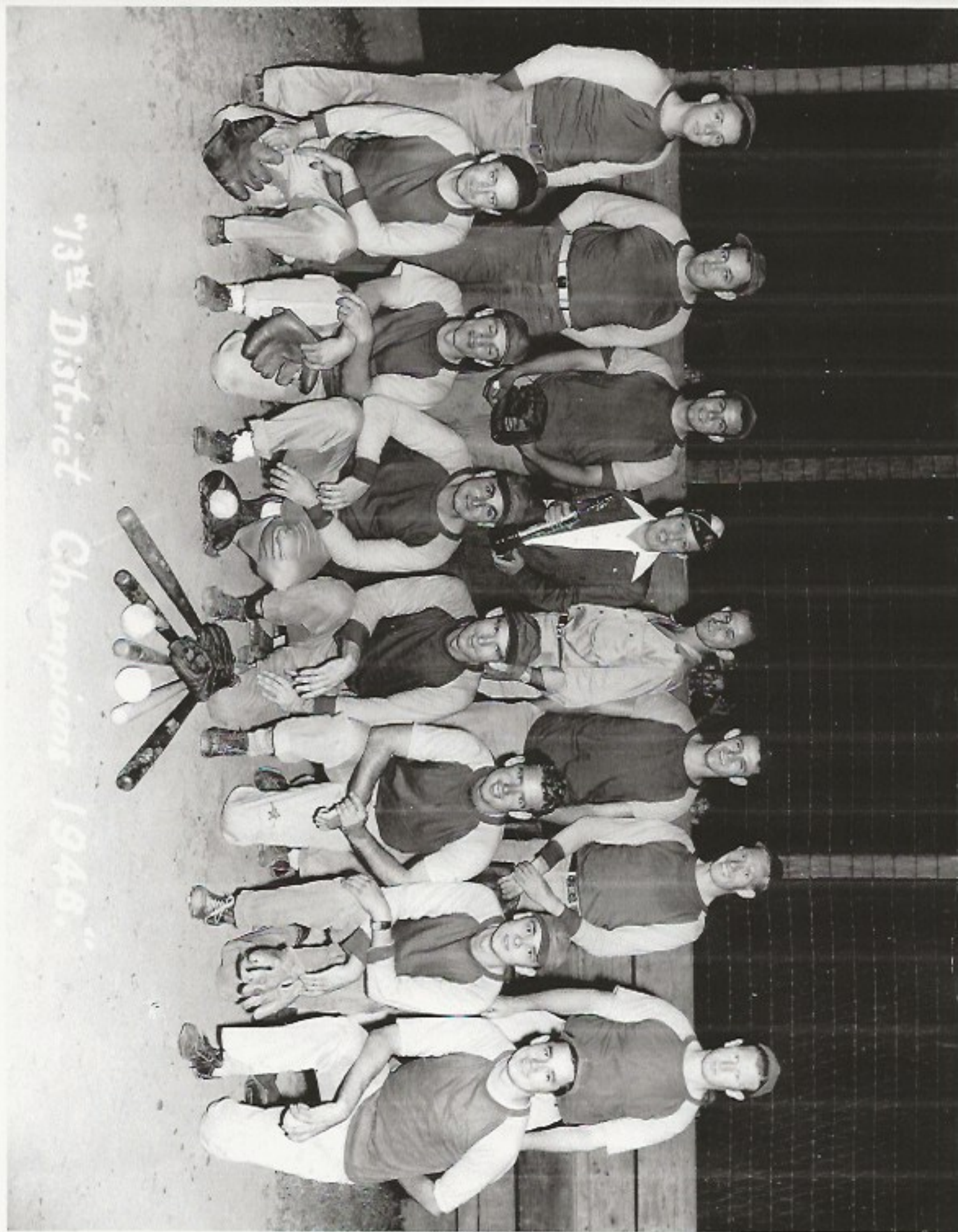
"13th District Champions 1946"