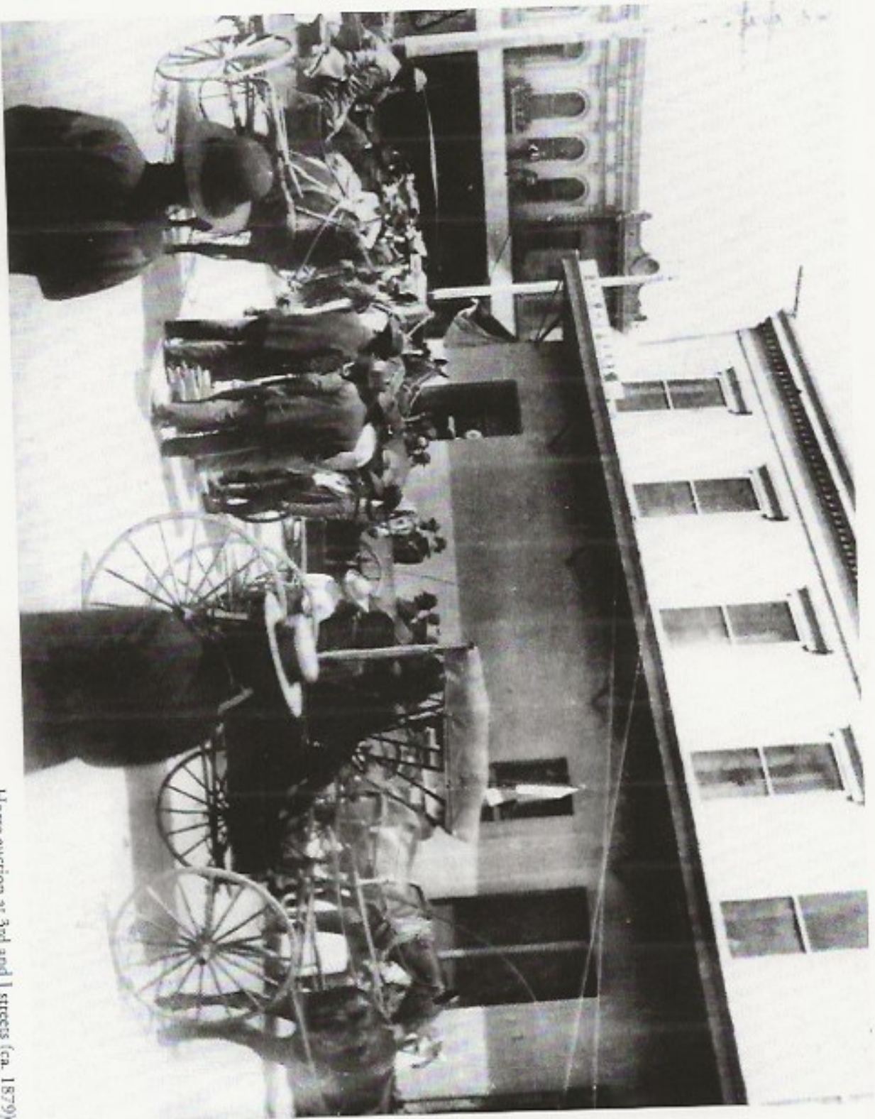
Horse auction at 3rd and J streets (ca. 1879).