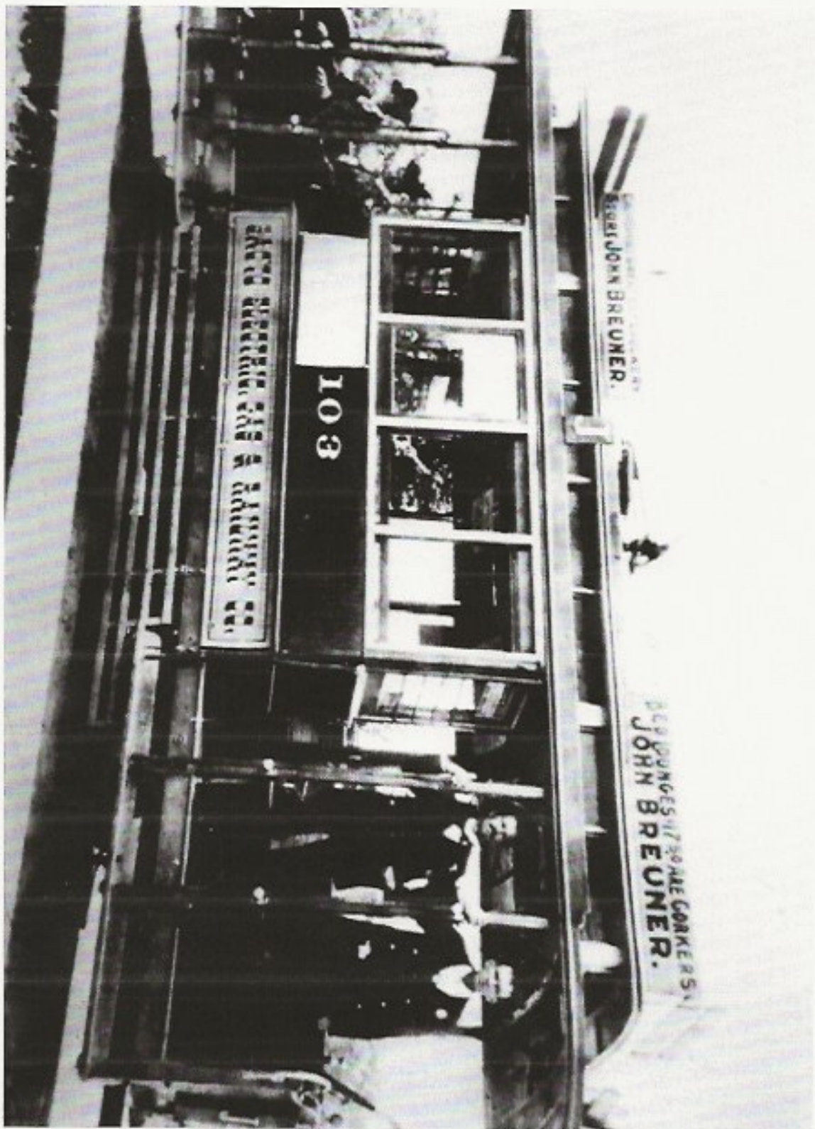
Electric streetcar in downtown Sacramento (ca. 1891).