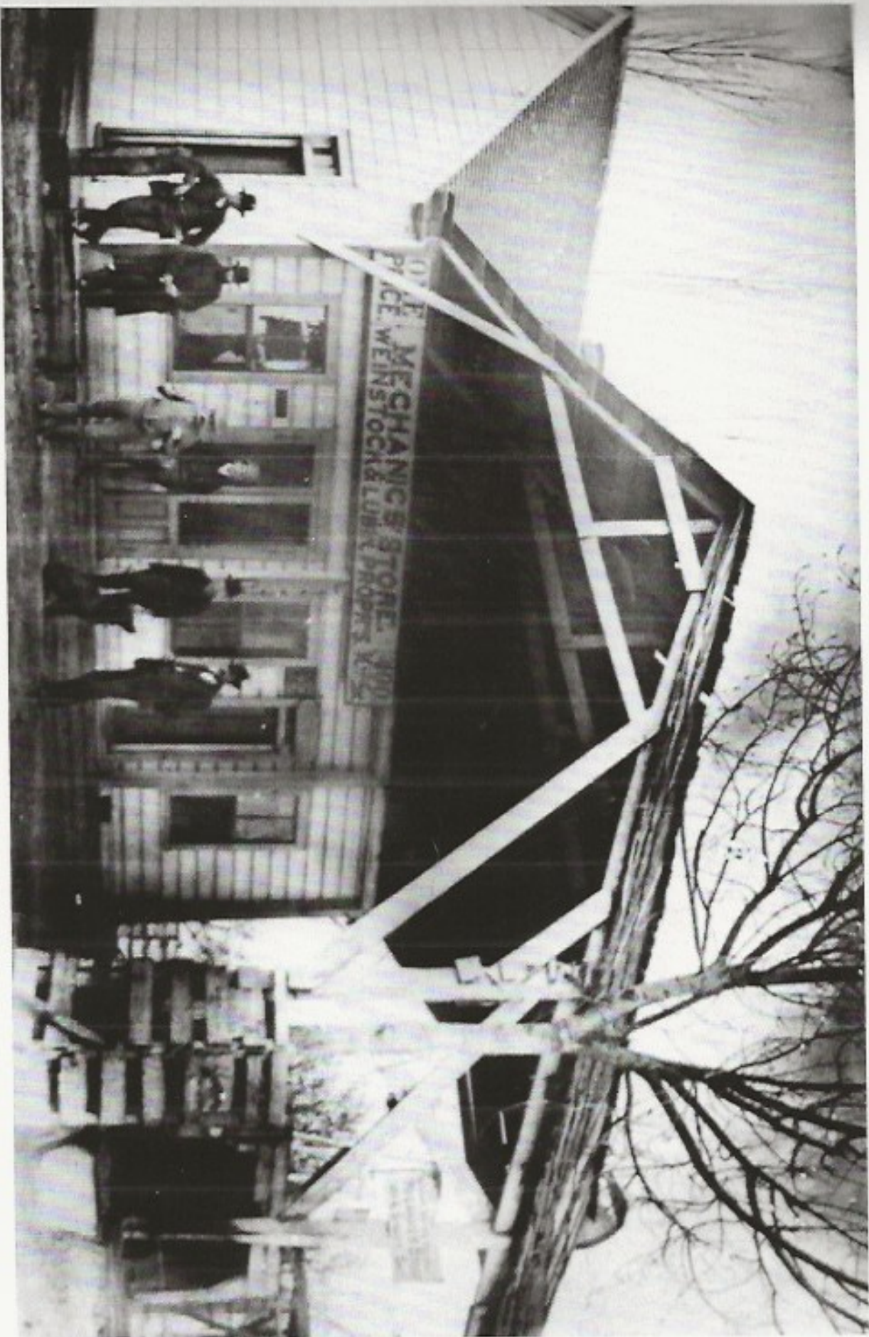
Mechanics' Store on K Street (ca. 1870)