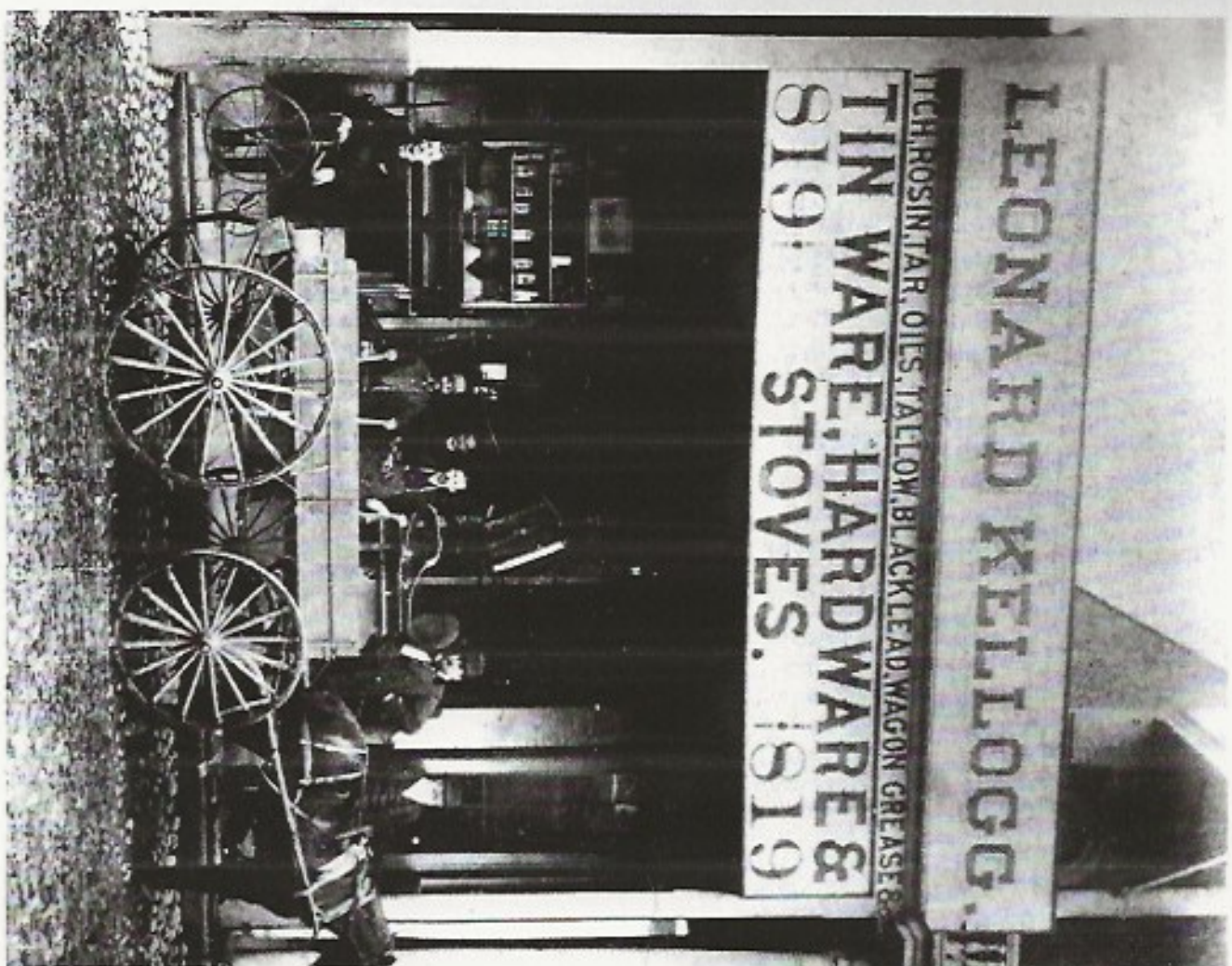
The Leonard Kellogg Hardware Store (ca. 1883).