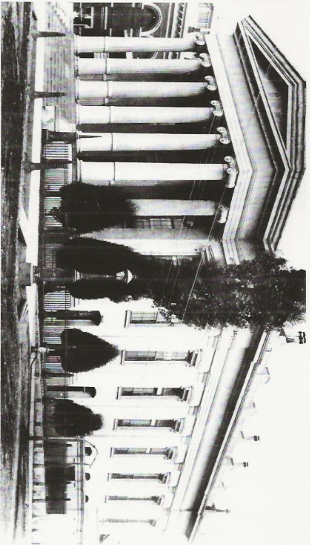
Sacramento County Courthouse on 7th Street (ca. 1865). This second Sacramento courthouse was built in 1855, and it served as a meeting place for the state legislature until the state capitol was completed in 1869.