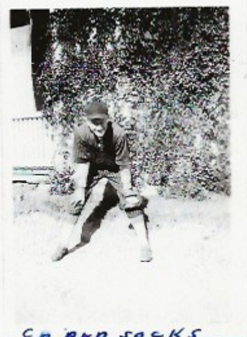
CB RND SOCKS