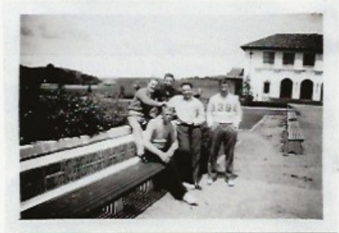
↑ 38 WHITE