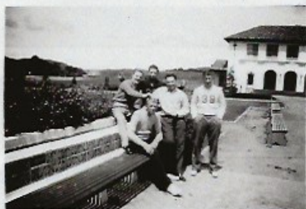
↑ 38 WHITE