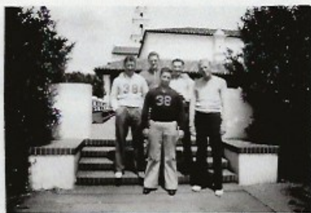
↑ 38 WHITE