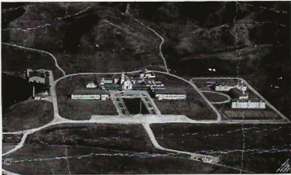
SAINT MARY'S COLLEGE, CONTRA COSTA COUNTY, CALIFORNIA