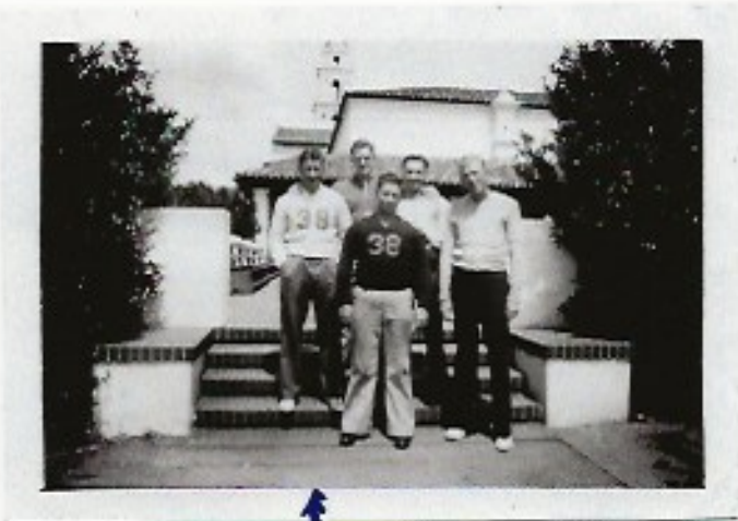
↑ 38 WHITE