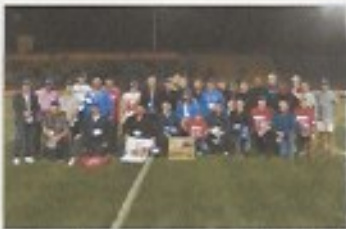
1981 Football Team

The 1981 championship-winning football team was honored at the CB vs. Capital Christian game on September 15, 2018.