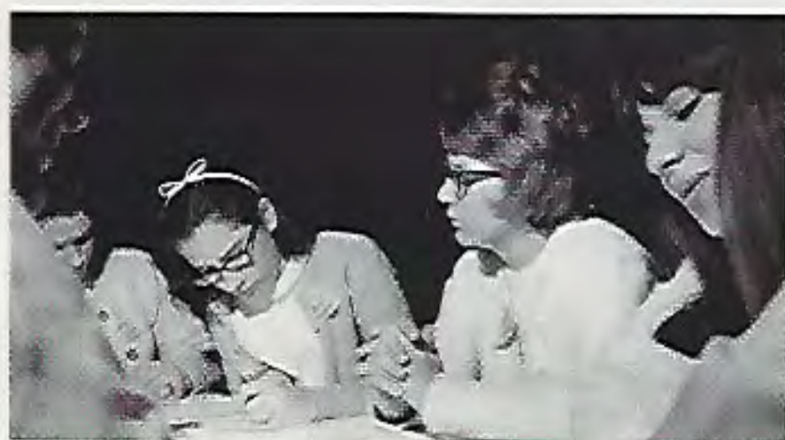
Sophomores participate in a weekend Cursillo- like Search for Christian Maturity.