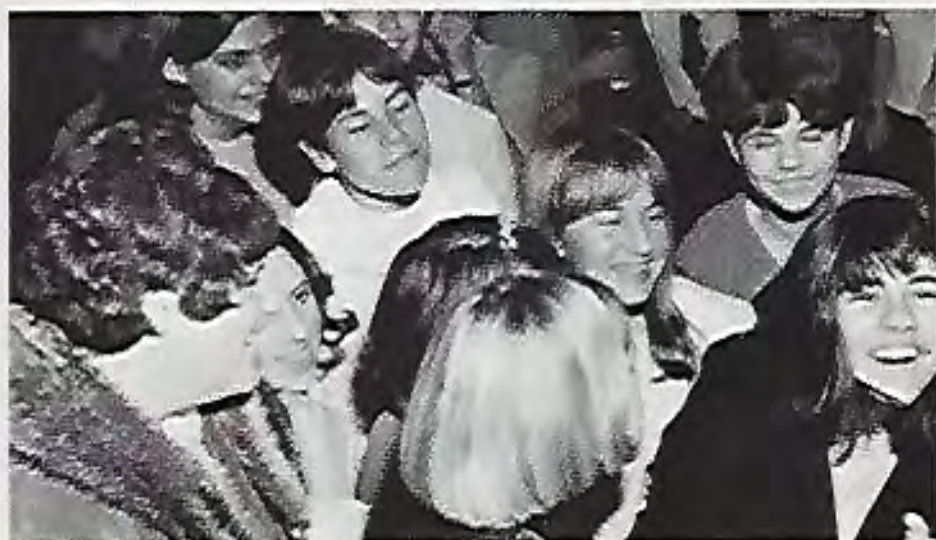
Freshman spirit captured in a face.