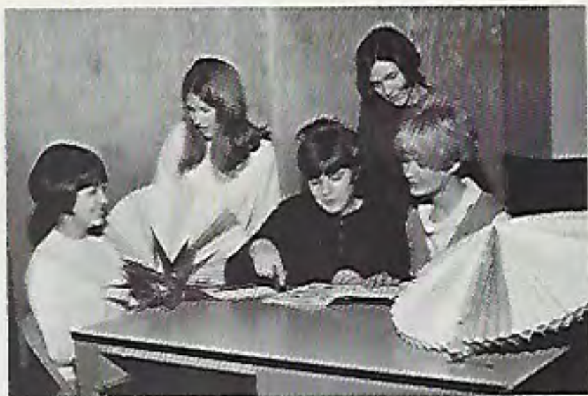
Junior Prom Committee share ideas for "Under the Sweetheart Tree."

Hers is the familiar face of an old friend greeting you in the halls. Self-confident and capable in leadership, diligent, responsible, yet with a twinkle of mischief about her--