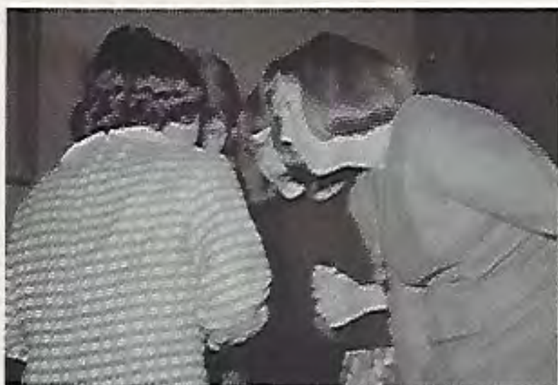
What's brewing tonight, girls?