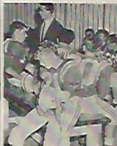
SHOWER ROOM STUDY PERIOD.

Marysville led until the last quarter when Ron Peters dashed over the goal line with one minute left in the game. The game ended a few plays later C.B.S. edged out the Indians 8 to 6.