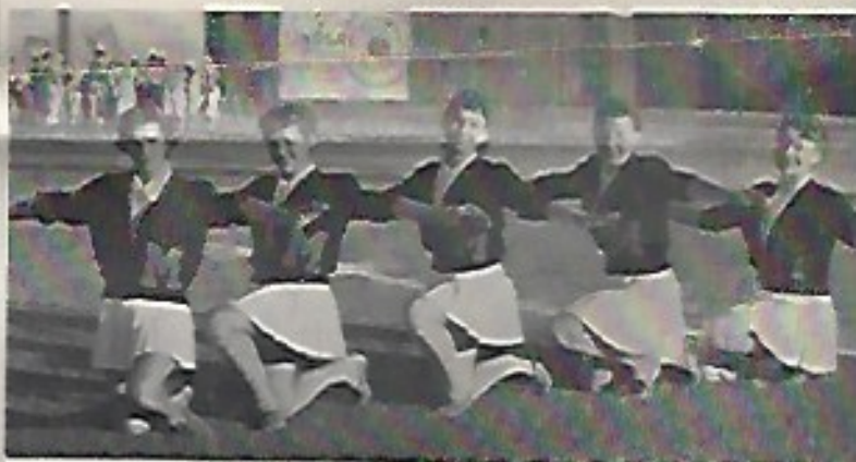
MARYSVILLE CHEERS — ! !