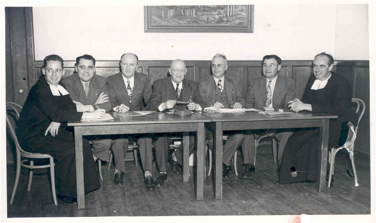
La Salle Club Meeting 1948