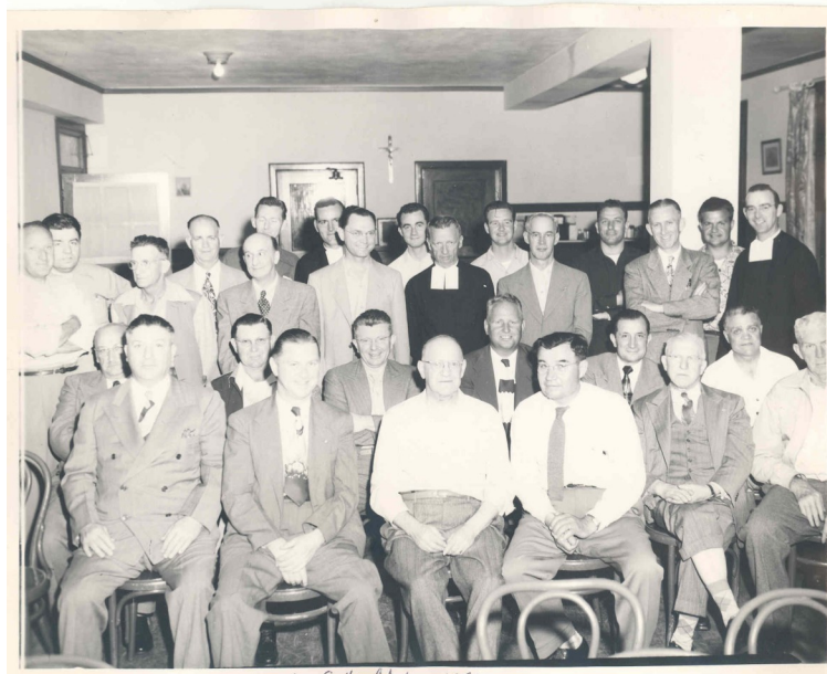
A 1951 La Salle Club Gathering

The oldest and most productive of these groups has been the La Salle Club. This organization has supported Christian Brothers for 72 consecutive years and is still active today!