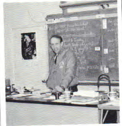
COMMITMENT TO EXCELLENCE