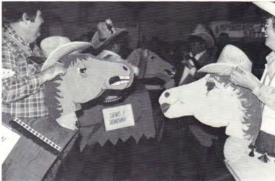
Two horses square off as the fun begins at a recent Western Night at the Races.

Parent Service Organization Marks Its Tenth Running of Triple Crown Event