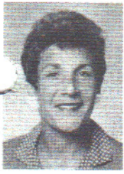
By Vienna Cornacchioli Golsong '61