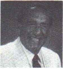
By Jack Stassi, '40