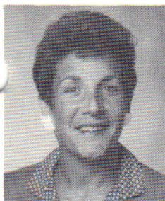
by Vienna Cornacchioli Golsong '61