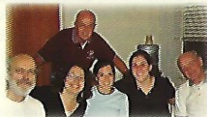
Volunteers live in community with Brothers and other Lasallian partners, fully sharing in their daily community and apostolic activities.