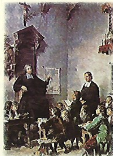
“Monsieur de La Salle had the idea of setting up gratuitous schools where the children of workmen and the poor would learn reading, writing and arithmetic, and would also receive a Christian education through catechisms and other forms of instruction appropriate for forming good Christians.”—from a Memoir written in Rouen in 1721

De la Salle died on April 7, 1719. His untiring faith and zeal inspired a modest revolution in Christian education in his day and continues to stir the hearts of educators everywhere. De La Salle was canonized a saint of the Catholic Church on May 24, 1900 and proclaimed patron of all teachers of youth by Pope Pius XII on May 15, 1950.