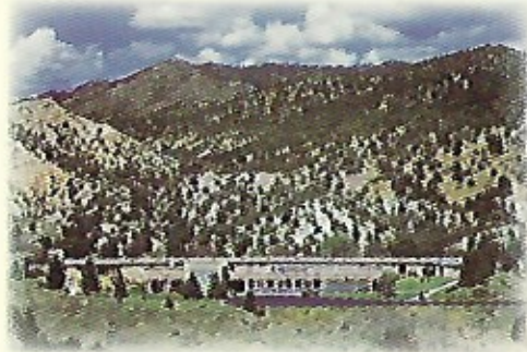
The Sangre de Cristo Center sits on the foothills of the Sangre de Cristo Mountains in Santa Fe, New Mexico.

S angre de Cristo Center was established by the Brothers of the Christian Schools in 1962 as a second novitiate program in the U.S. It is a place for renewal, grounding and discovery. The site was chosen primarily because of its wild natural beauty, its bracing climate at an elevation of 7,100 feet, and its almost constant sunshine and clear air.