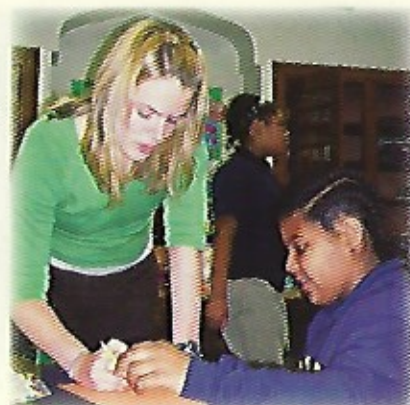
Lasallian volunteers work with children from economically poor families.