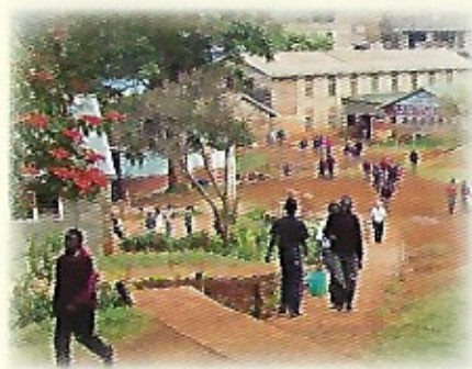
St. Mary's Secondary School in Nyeri, Kenya, opened on October 1, 1959. In 1990, the Brothers were asked by the Archbishop of Nyeri to take over administration of the school.

The Twinning Program of the Institute of the Brothers of the Christian Schools partners Districts capable of providing funds with those that are in need. The Districts in the USAT Region are twinned with the Lwanga District in Africa which includes the countries of Kenya, Nigeria, Eritrea, Ethiopia and South Africa.