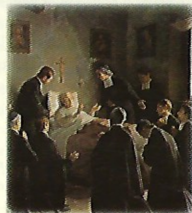
John Baptist de la Salle at his death bed.

Three Brothers from Montreal, Canada, arrived in St. Louis, Missouri, and established a school.