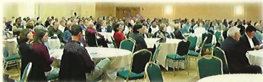
In November 2007, 300 educators gathered in St. Louis, Missouri, for the 34 th Huether Lasallian Conference.

THE HUETHER LASALLIAN CONFERENCE is an annual gathering of Lasallian educators in the Region. This event explores emerging educational issues and themes related to formation for mission and Lasallian spirituality. The conference concludes with a banquet honoring the Distinguished Lasallian Educator of the Year in each District.