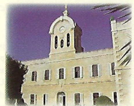
De La Salle Hall at Bethlehem University was built in the year 1893 to house the Christian Brothers elementary school known as Freres School. In 1973 Freres School moved to a different location and Bethlehem University was founded by three Brothers from the U.S.

B ethlehem University of the Holy Land is a co-educational institution of higher learning founded in 1973 by the American Brothers of the Christian Schools. It offers a broad and practical university education in arts and sciences to meet the needs of the Palestinian society and is open to students of all faith traditions. It is the first university to be established in the West Bank and is located