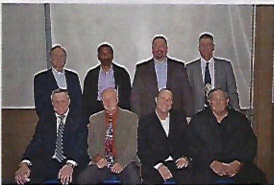
Baseball HOF Class of 2016