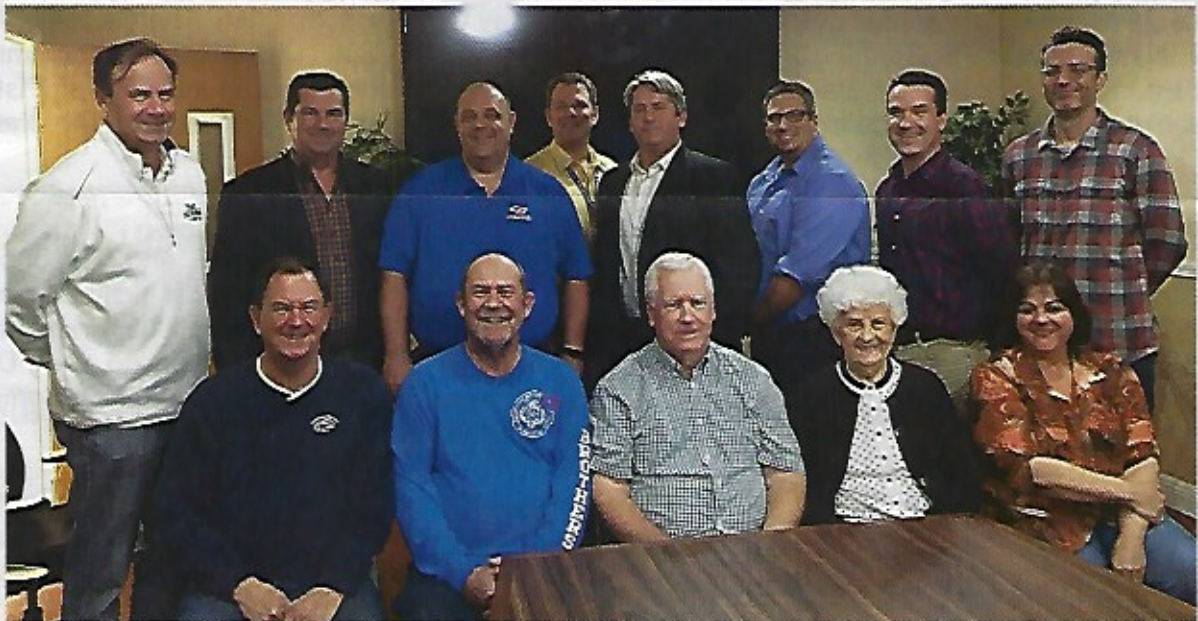
The La Salle Club Board, 2016