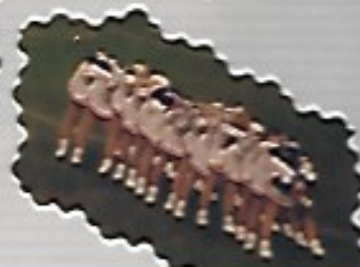
C.B. vs. Sacramento High