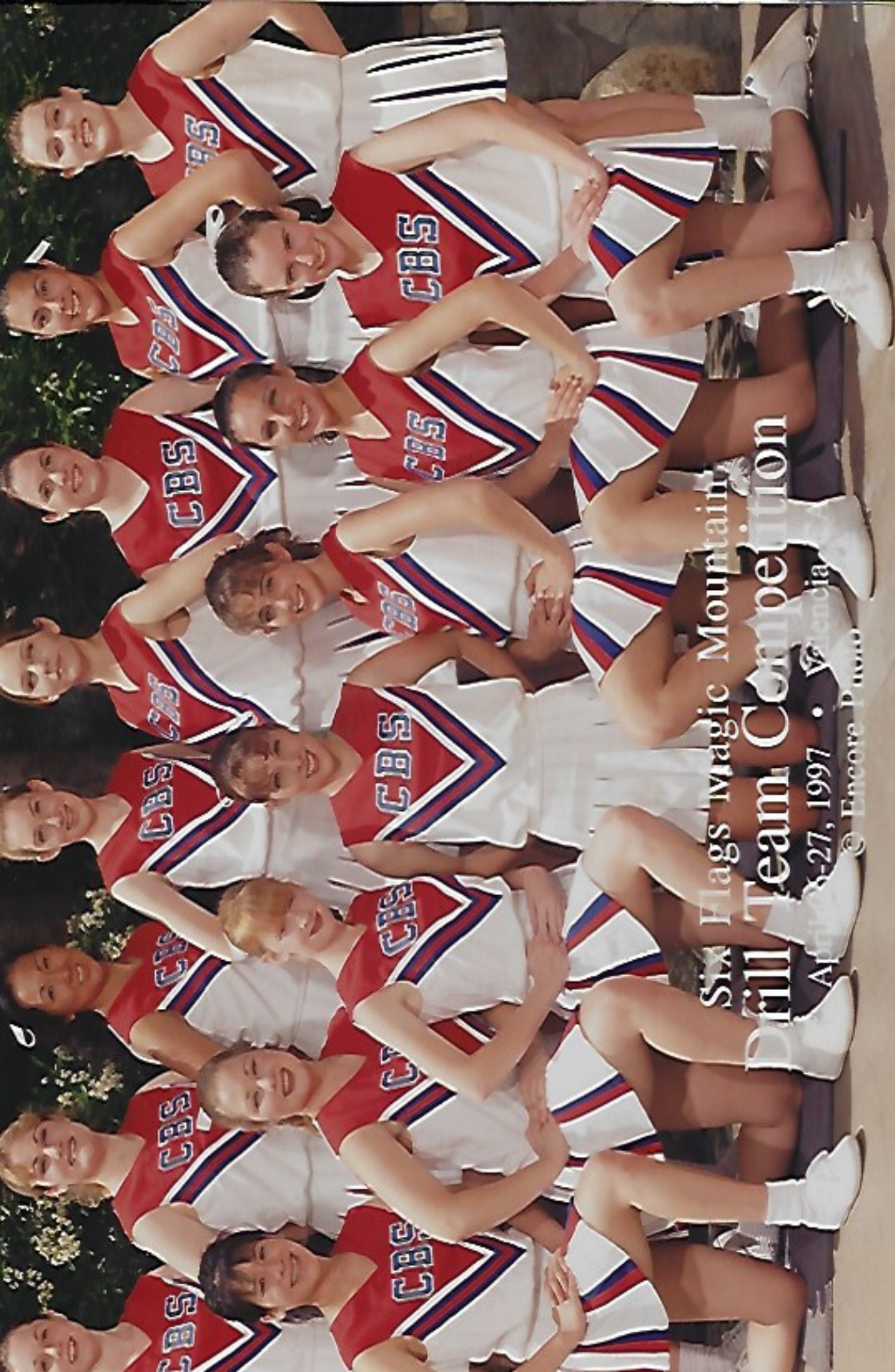
Six Flags Magic Mountain Drill Team Competition April 23-27, 1997 • Valencia