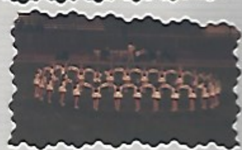
C.B. vs. Stagg September 28, 1996