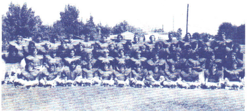
1981 Metro League Champions, Christian Brothers Varsity Falcons.